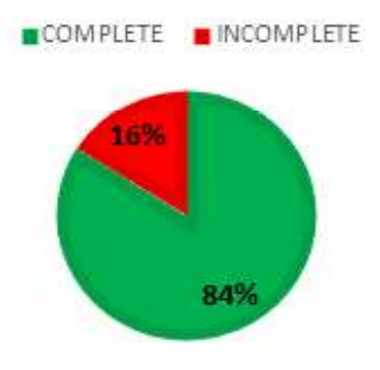
Figure 2. The effectiveness results of affective

Students who achieve the KKM score are 84%, and those who do not complete are 16%. Based on the percentage of completeness, it can be concluded that the blended learning program based on local wisdom is very good for improving learning outcomes in the affective domain. The incompleteness of learning outcomes in the